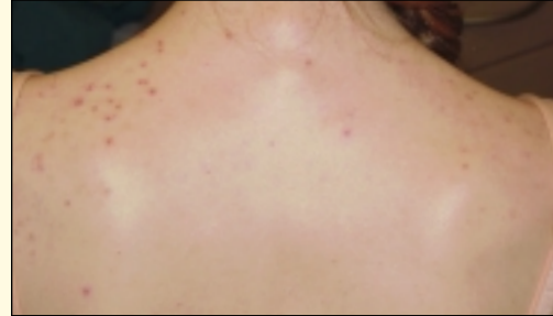
After Smoothbeam Treatment of right side