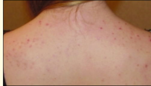
Before Smoothbeam Treatment of right side

Laser treatment is a new approach to acne. The Smoothbeam laser is designed to target acne's root cause, the overactive sebaceous gland located within the dermis (the second layer of the skin). By emitting